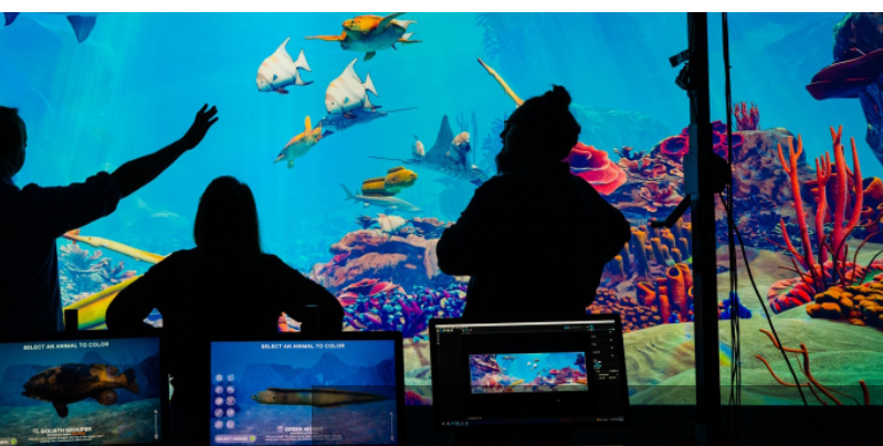
MOBILE DISCOVERY CENTER (TRAVELING) GLOBAL WATER CENTER, NORTH CHARLESTON, SC

To view more exhibition openings, visit: www.name-aam.org/new-gallery