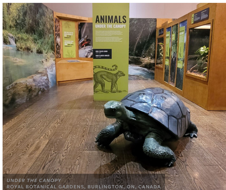
UNDER THE CANOPY ROYAL BOTANICAL GARDENS, BURLINGTON, ON, CANADA